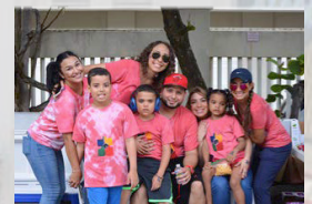
GERSH ACADEMY TRAINED STAFF

For event information, tickets, sponsorships and more, visit: www.customeducationfoundation.org/sixflags